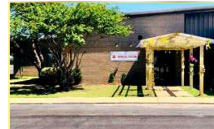
Sathya Sai Sanjeevani Medical Centre (Inaugurated in June 2019)

In the month of July 2023, 145 patients were treated at Sathya Sai Sanjeevani Medical Centre at Clarksdale.