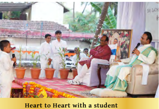
15 February 2023 - Sri Sathya Sai Sharadaniketanam, Mandya