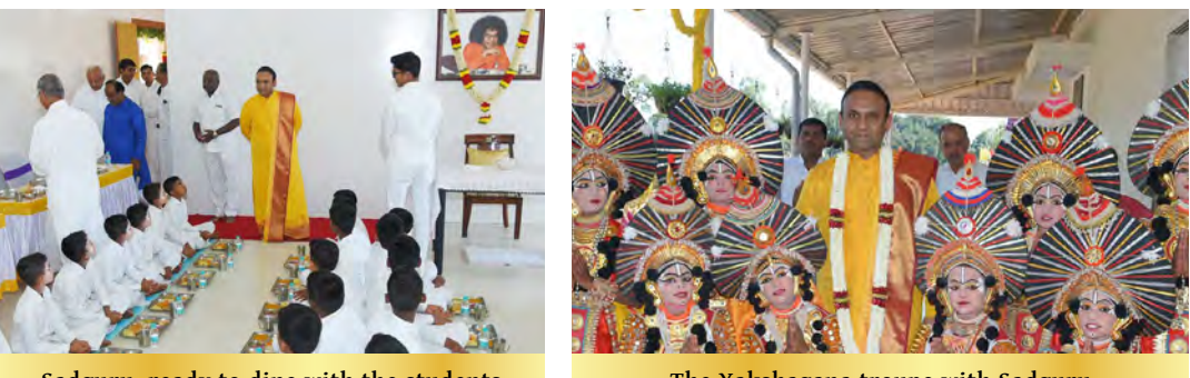
Sadguru ready to dine with the students