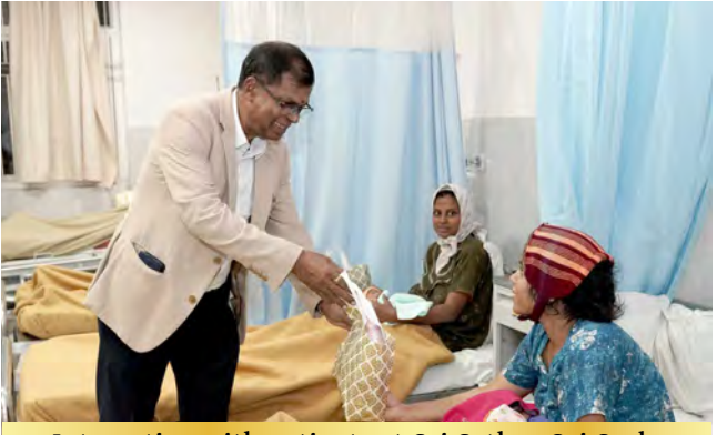
Interaction with patients at Sri Sathya Sai Sarla Memorial Hospital