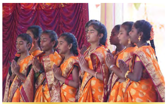
Children of Sri Sathya Sai Higher Secondary School Vatadahosahalli chanting vedas