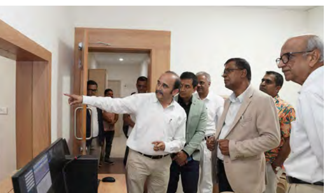
Tour of Sri Sathya Sai Sanjeevani Heartcare Centre, Muddenahalli