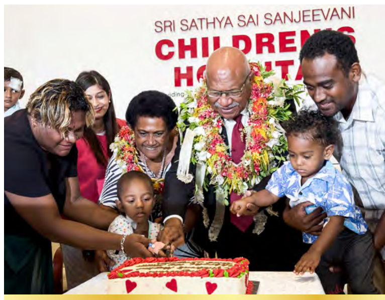
Prime Minister of Fiji, Mr Sitiveni Rebuka celebrating the completion of 100 life-saving surgeries at Sri Sathya Sai Sanjeevani Children's Hospital