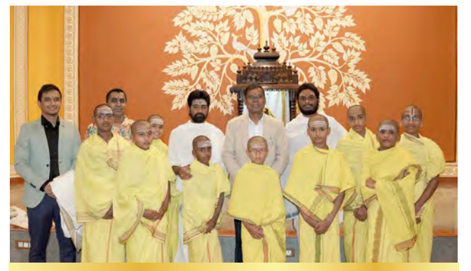
With the vațus at the veda pāțhaśālā