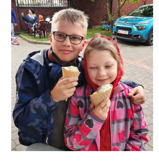
Stowarzyszenie Love All -Serve All (Love All - Serve All Association) Poland