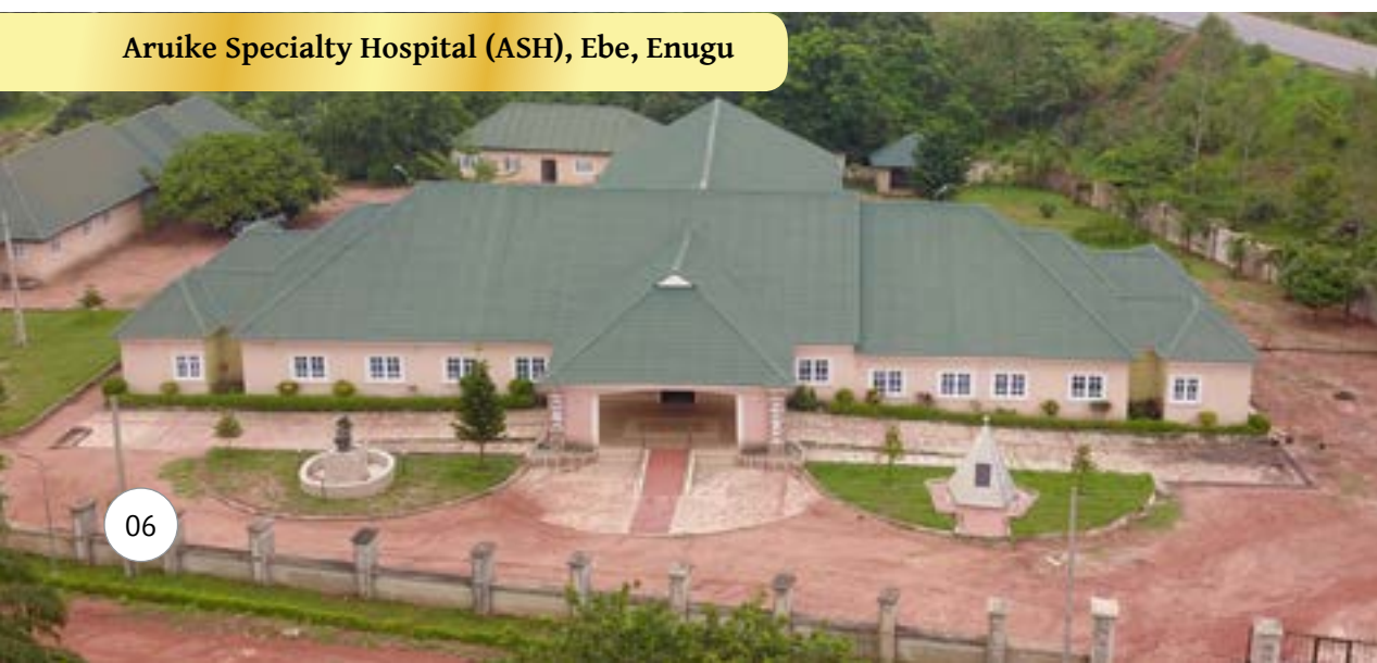
Aruike Specialty Hospital (ASH), Ebe, Enugu