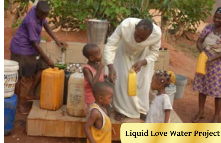
Liquid Love Water Project