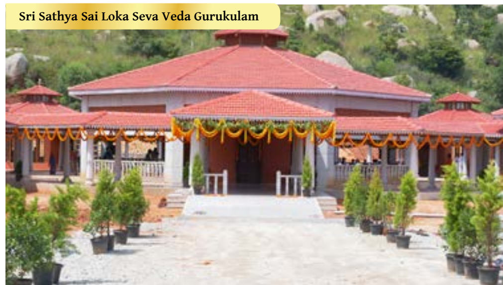
Sri Sathya Sai Loka Seva Veda Gurukulam