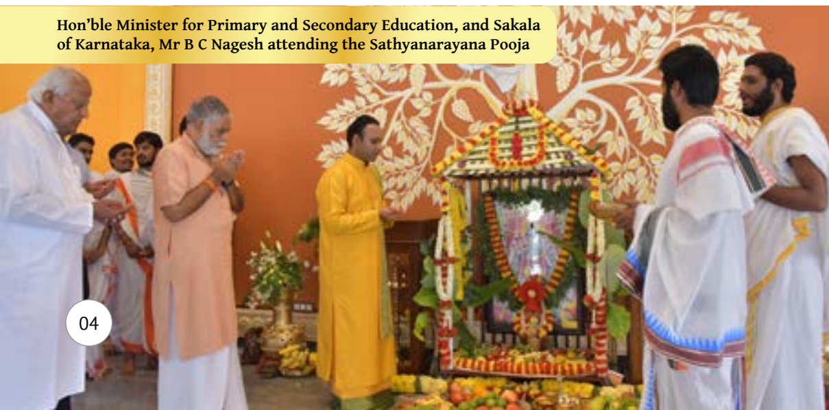
Hon’ble Minister for Primary and Secondary Education, and Sakala of Karnataka, Mr B C Nagesh attending the Sathyanarayana Pooja

āmāyantu brahmacāriṇaḥ svāhā | vimāyantu brahmacāriṇaḥ svāhā | pramāyantu brahmacāriṇaḥ svāhā | damāyantu brahmacāriṇaḥ svāhā | śamāyantu brahmacāriṇaḥ svāhā | yaśo jane’sāni svāhā |