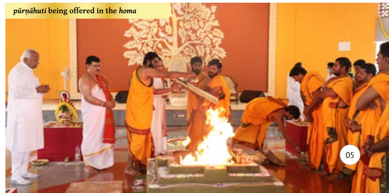
pūrṇāhuti being offered in the homa

In this temporary world, vedic education alone is permanent. What is most important to me is you realising your true divinity within. Your education ends when you realise that you are Divine. For me, your education won’t be finished if you learn all the scriptures and graduate from the gurukulam. It will complete only when the jīvātmā and paramātmā becomes one. According to me, that is graduation, till then I would consider you only as uneducated. Therefore, all the students studying in the veda pāṭhaśālā have a great responsibility on their shoulders. Learn everything with utmost śraddhā (dedication), bhaktī (devotion) and with the feeling of ātmasamarpaṇa (self-dedication). In the coming future, this gurukulam will grow into many more such gurukulams, and it will be the responsibility of the students passing out from the portals of this veda gurukulam to look after them.”