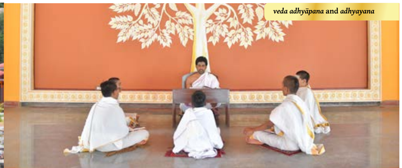
veda adhyāpana and adhyayana