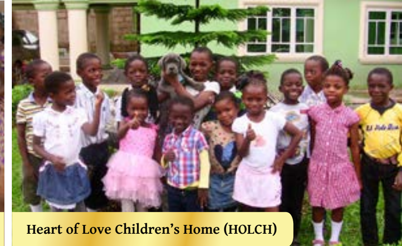
Heart of Love Children’s Home (HOLCH)